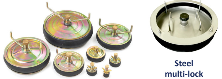
Steel multi-lock stopper

PPM also manufactures a range of steel plugs from 1½" (40 mm) upwards in diameter. These plugs are typically suitable for more heavy duty applications, heat resistant up to 90°. These plugs are typically used for general sealing of pipes and purging.